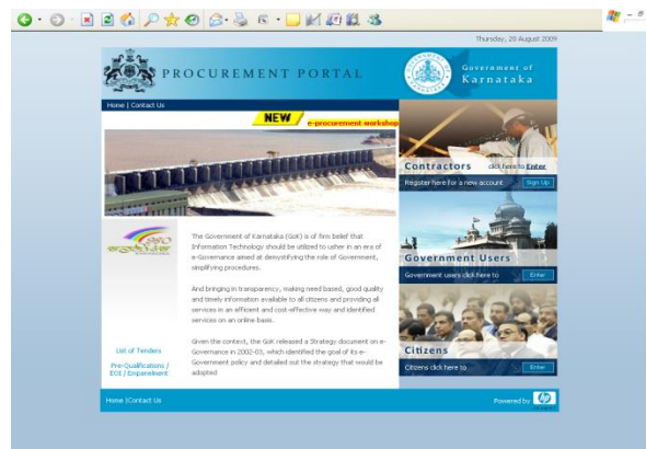
Fig 1 Home page of e-Procurement portal

The bidder can pay the EMD and tender transaction using any of the following payment modes in the e-Procurement portal: